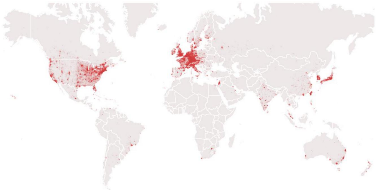
Figure 1. (Color online) Inventor Locations

Notes. Each inventor location (prior to mapping to the closest airport) is plotted as a red dot. Inventors with the same latitude and longitude are jittered, so they are not plotted directly on top of each other.